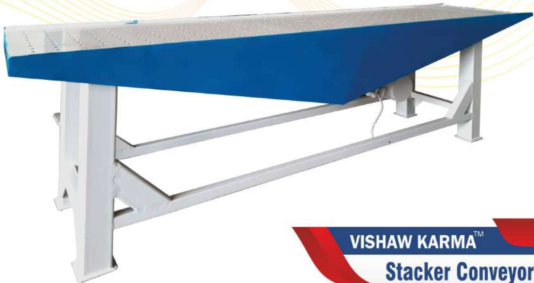
VISHAW KARMA ™ Stacker Conveyor Belt