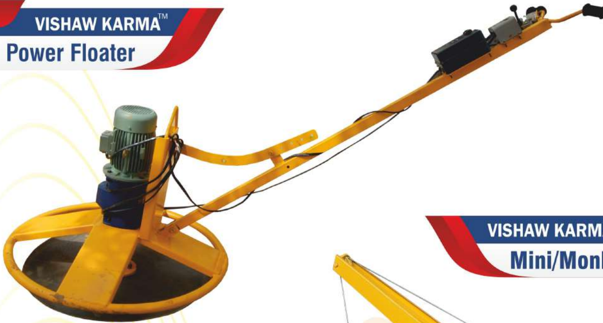
VISHAW KARMA ™