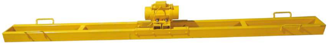
VISHAW KARMA ™ Power Floater