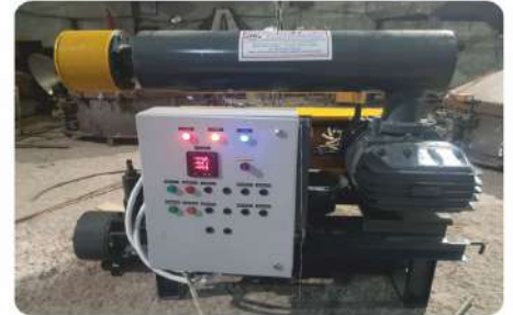
Cement Feeding System